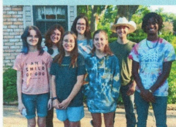
Church Camp 2025!