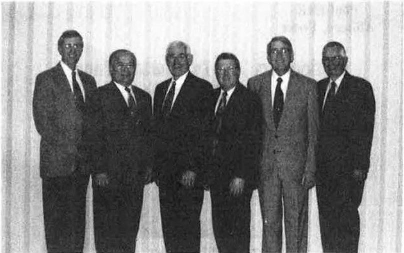
The 1996 Officers Of The Missionary Baptist Association Of Texas