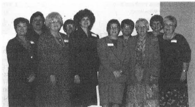
The 1996 State Ladies' Auxiliary Officers