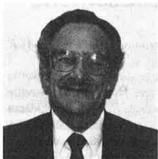
Marlin Freeman Center, Texas