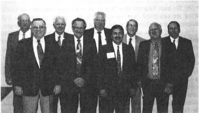
The Newly Elected Missionaries

and we will come unto him, and make our abode with him," John 14:23. In our text, Jesus taught the great lesson to His young church which was, "I am all you need." Perilous times are upon us morally, religiously, and maybe even physically - times like we have never known, but Jesus is with us. He is all we need. I close with these words from the apostle Peter, 1 Peter 5:8-10, "Be sober, be vigilant; because your adversary the devil, as a roaring lion, walketh about, seeking whom he may devour: Whom resist steadfast in the faith, knowing that the same afflictions are accomplished in your brethren that are in the world. But the God of all grace, who hath called us unto his eternal glory by Christ Jesus, after that ye have suffered a while, make you perfect, stablish, strengthen, settle you."