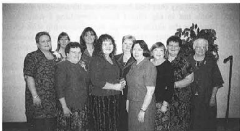
Officers of the State Ladies' Auxiliary