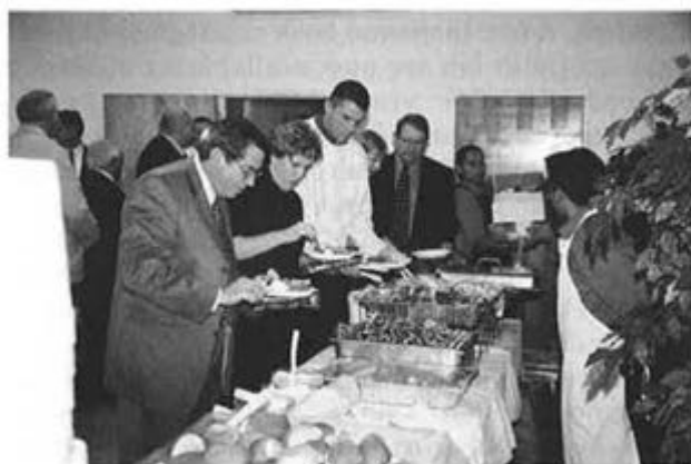
Food Line at the Alumni Banquet