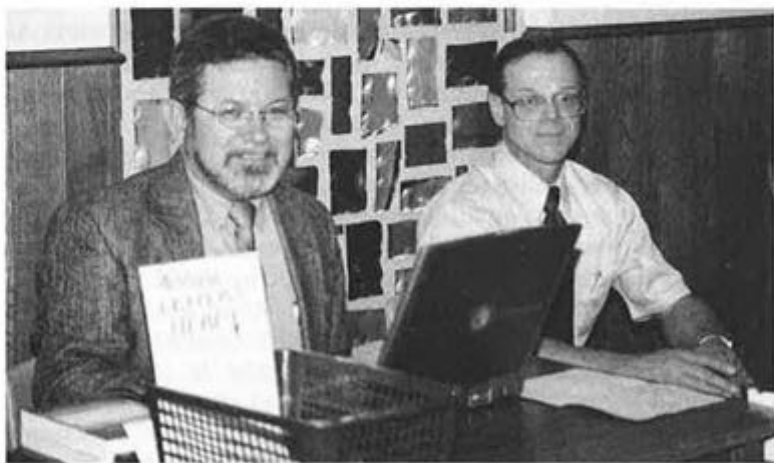
Enrollment & Finance Committee at Work