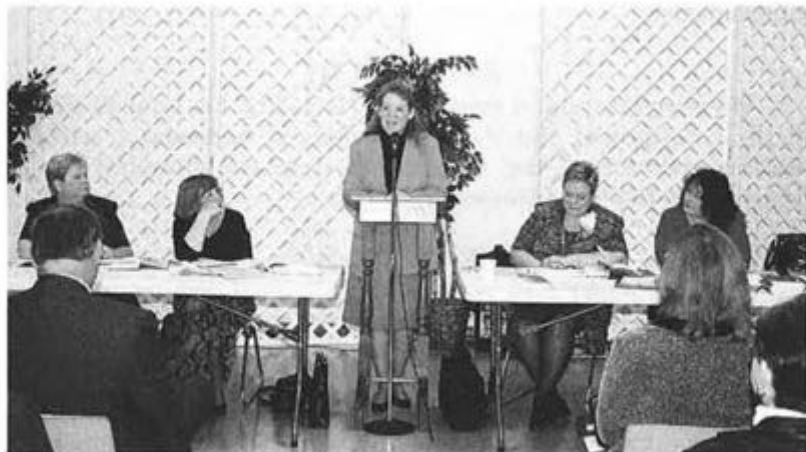
State Ladies' Auxiliary Meeting

20. We believe in the complete separation of churches and state (Matt. 22:21) and affirm our belief in civil obedience unless the laws and regulations of civil government run contrary to the Holy Scriptures (Rom. 13:1-7; I Peter 2:13-15; Acts. 5: 29).