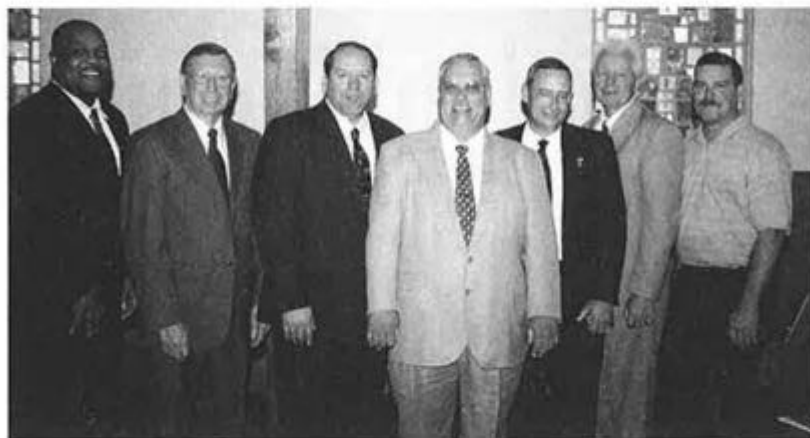
Missionaries of the MBA of Texas