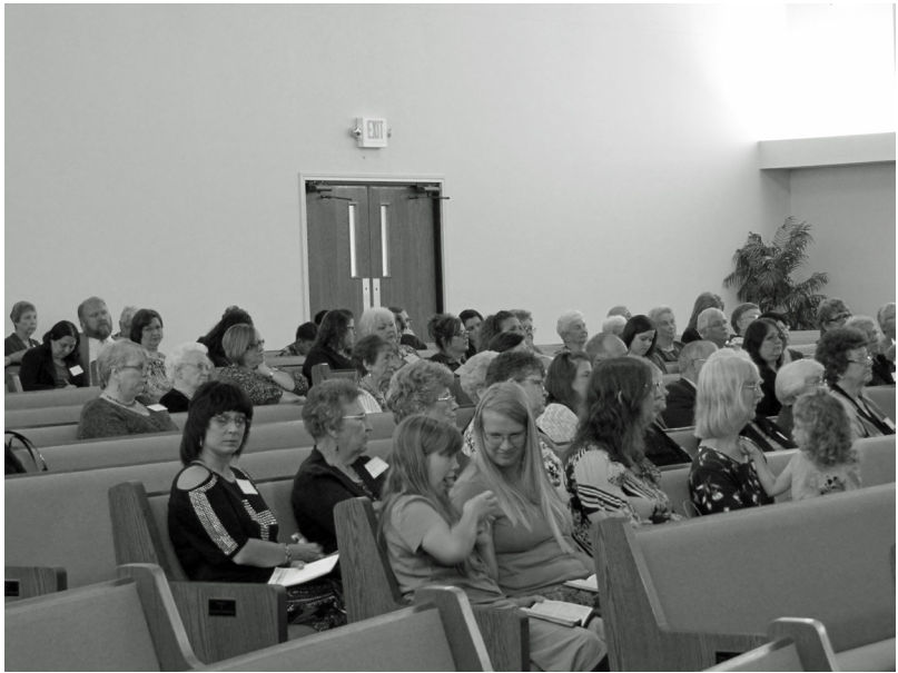
The Ladies Meeting in the auditorium of Nevell's Chapel Missionary Baptist Church.

The Messenger Assembly shall have no power to change the Articles of Agreement. Any church desiring a change shall send to the annual meeting a copy of the proposed change; the Messenger Assembly will then submit the proposed change to each cooperating church; if two-thirds of the cooperating churches vote for the change, then the Article of Agreement shall be amended to conform to the proposed change. Two-thirds of the churches representing in assembly in the previous year shall be the number determining the results.