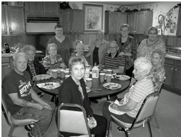
The men and women of Nevill’s Chapel who provided an amazing meal for the TBI Alumni banquet.