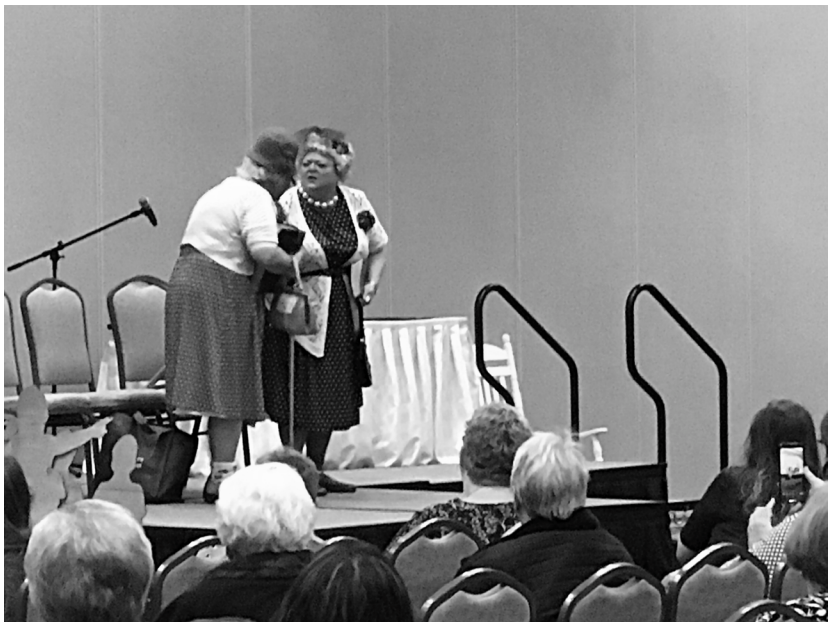
“Ruby and Pearl”...“Jewels For Jesus” A Skit presented by the host church